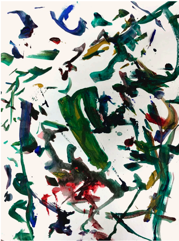
Painting created by a Twelveacres resident

Forwarding and Return Postage Guaranteed