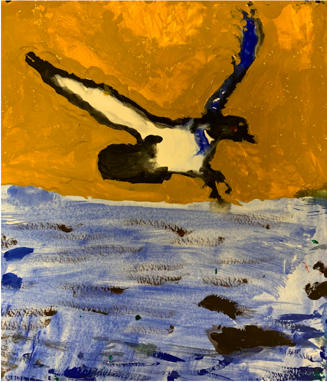
Painting created by a Twelveacres resident