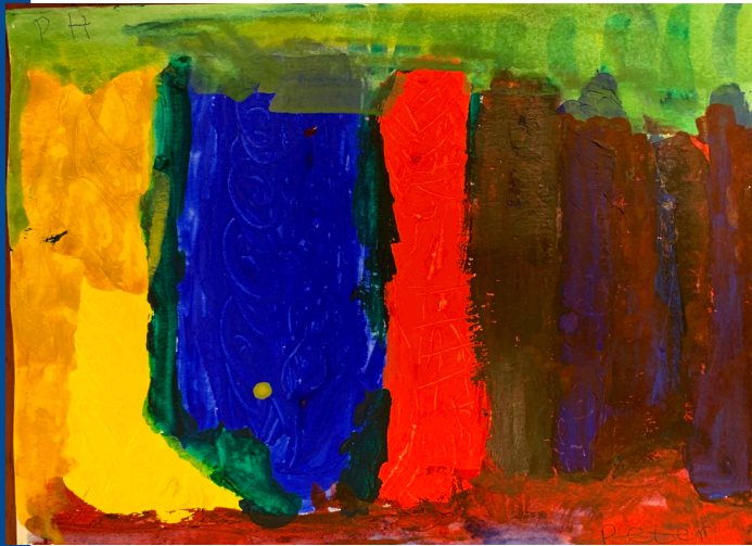
Painting created by a Twelveacres resident

Recently I saw a short video on LinkedIn, in which a gaggle of young basketball players jostled over the ball, the blue team closing in on the white team's basket. All at once they slowed down, as the tallest boy — number 50 in blue — caught the ball and held it. Instead of shooting, he made room for the smallest boy, number '0', who appeared to be developmentally challenged as he ambled awkwardly into center court. The taller boy helped his teammate hold the ball and aim, while the other players stood still, watching in anticipation. With four hands on the ball, together they threw it, and it almost landed in the basket. All the players then raced to the other side of the court, number '0' pumping his fists joyously and high-fiving his loving coaches as he ran past them.