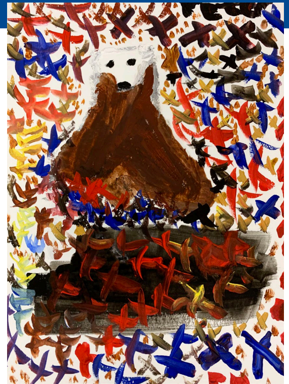
Painting created by a Twelveacres resident